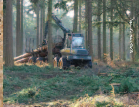
Nigel Symes (RSPB)