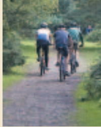
Mike Read (rspb-images.com)

Our parks and community spaces offer an excellent opportunity to connect wildlife and people. This course examines how amenity landscapes can be managed and maintained to benefit wildlife, offering the opportunity to find new ways in which conservation measures can be integrated with existing management protocols.