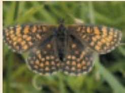
Jackie Cooper (rspb-images.com)

Lowland heathland is a fragmented and vulnerable habitat and particularly important for birds and other biodiversity. This workshop will inform on the ecology and habitat requirements of heathland dependent birds and address the thorny issue of how to integrate their needs with those of other wildlife, visitors and the survival of the heath itself.