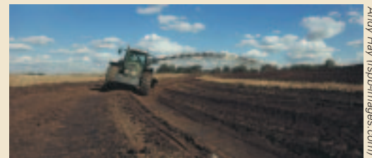
Andy Hay (rspb-images.com)

Date: 30 July Location: RSPB Otmoor Interested in cost effective and efficient wet grassland management? Find out how shallow wet features such as grips and scrapes can be created to benefit wading birds – giving access to invertebrates to feed their chicks in spring. On site with the 'Big Wheel' Rotary Ditcher, we cover all aspects of deploying and using the machine,