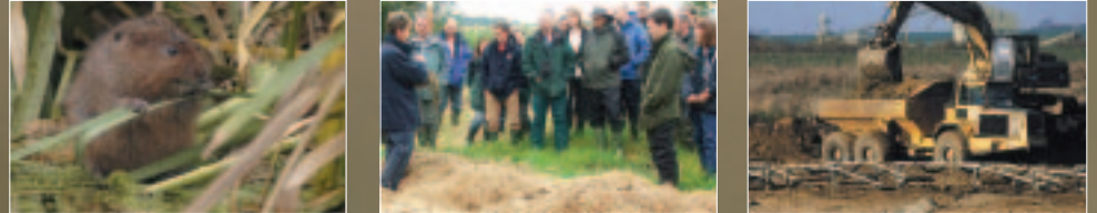
Cover: Water vole; Winchat; Stripping topsoil